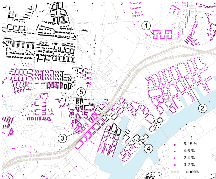
Fig. 1 The increase of proximity on the northern shore of the river Göta in Gothenburg

Fig 1 shows the increase of proximity brought by the tunnel alternative, compared to the present situation. As the maps shows, the increase is distributed in rather irregular patterns over the area surrounding the barriers. The highest increase of proximity is 15 % and is found in Backa (1). This increase in proximity implies that the distance between the residential addresses in this area, and the nearest education facility, health care facility, public transport stop or place with access to water, on average would become up to 15 % shorter. There is also a clear increase of proximity in parts of Ringön (2) and the southern part of Kvillestaden (3). Yet in Frihamnen (4) and the northern part of Kvillestaden (5) proximity stays more or less the same.